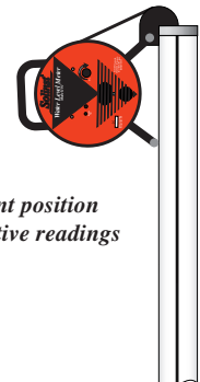
Convenient position for consecutive readings