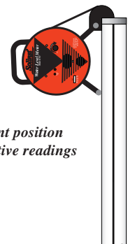
Convenient position for consecutive readings